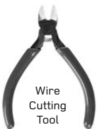
Wire Cutting Tool