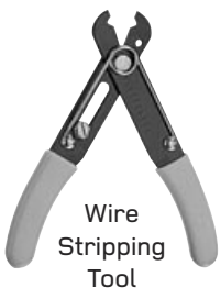
Wire Stripping Tool

For your convenience, Rovers North has pre-programmed your VDO speedometer with the "pulse" count off our test Defender. Due to variations in gearing and tire sizes, you should run the auto-calibration feature described below to get an accurate reading for your Defender. NOTE: This kit is designed for Defenders without an ECU.